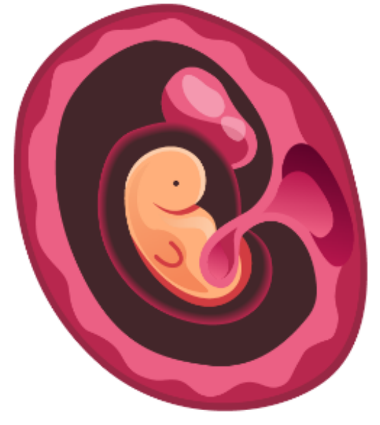
1 Month The child's first completed brain cells appear. The embryo's heart

has started its advanced stage of formation.